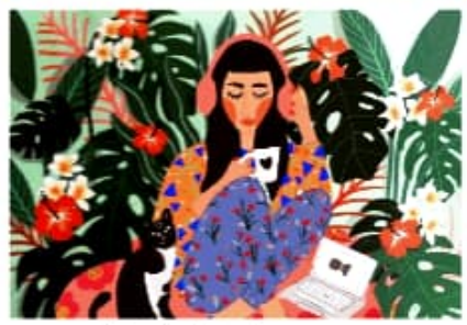
-Painting by Pritika Narsaria 10 CI