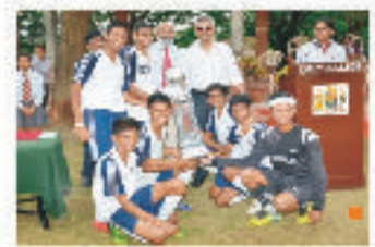
KASHIWA FOOTBALL TOURNAMENT