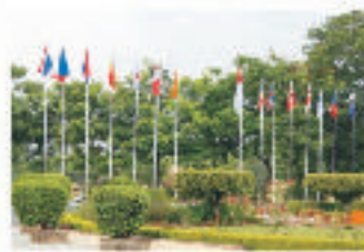
TILT SHIFT GALES SUMMIT 2014