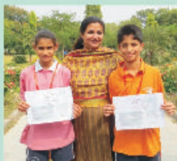
BEST ATHLETES LEVEL III