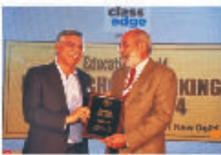
EDUCATION WORLD AWARD