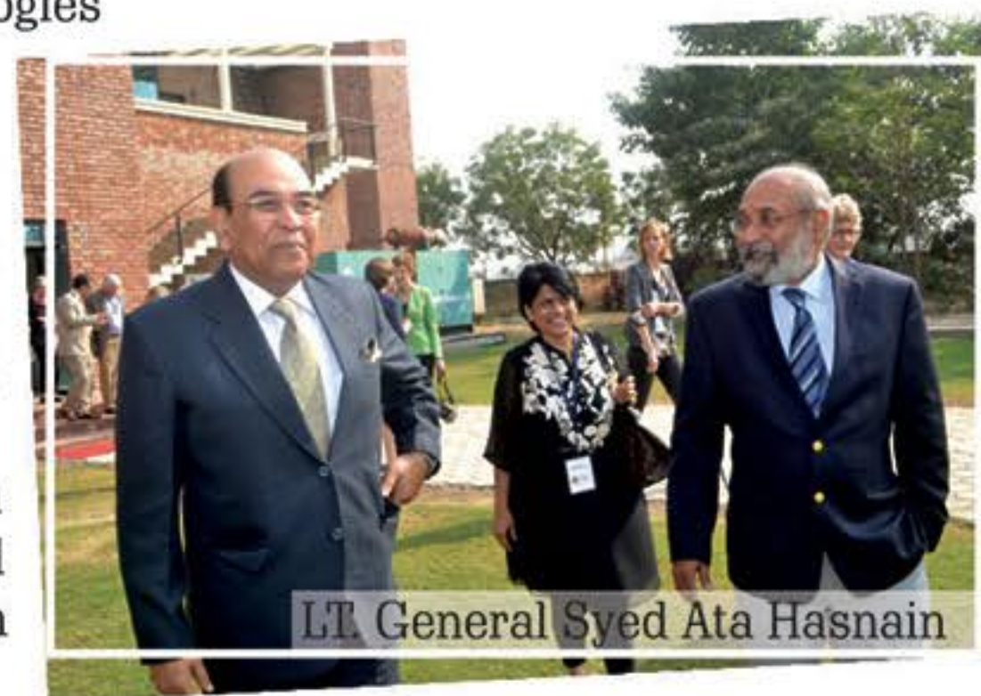
Lt. General Syed Ata Hasnain

The experience reminded the school leaders, that there is no substitute for face-to-face conversation to develop understanding and respectful relationships. In a modern, technology driven world, it is an appropriate time to be mindful about the need to ensure that our students are taught the art and joy of being involved in an enlightened exchange.