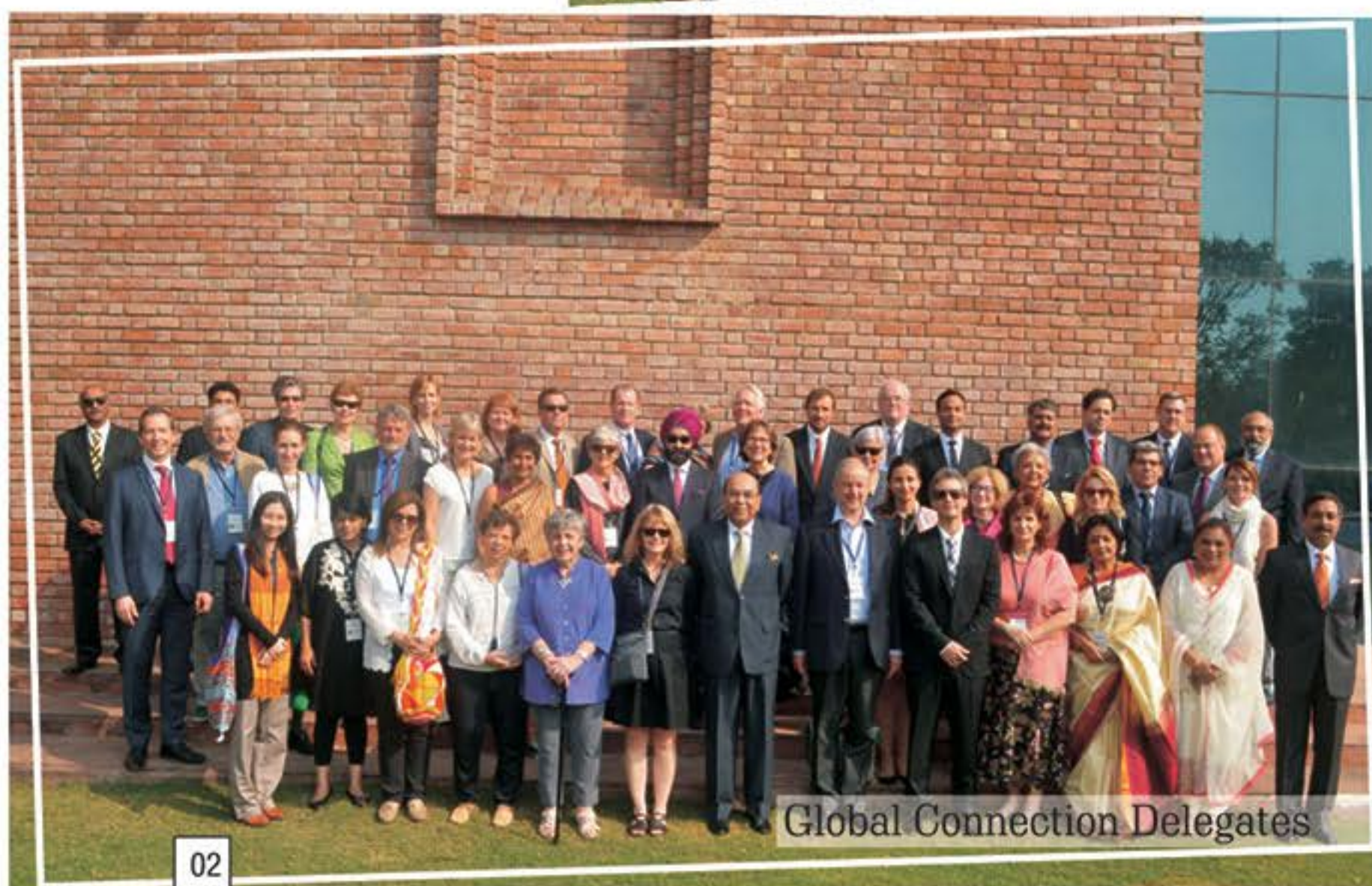
Global Connection Delegates