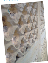
Figure out which part of school is this image from.