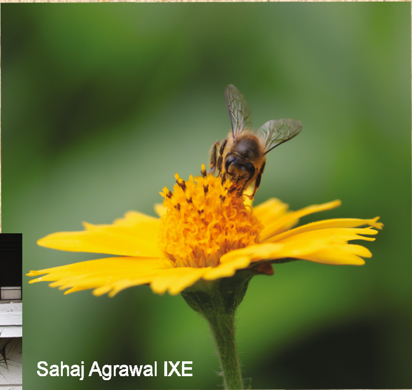
Sahaj Agrawal IXE

You don't take a photograph, you make it -Ansel Adams