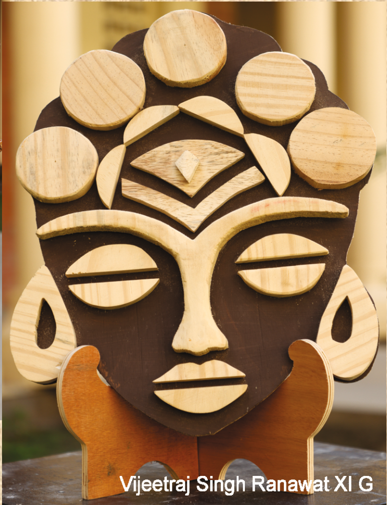
Vijeetraj Singh Ranawat XI G

Crafting is like meditation. it allows you to focus your mind and release your stress