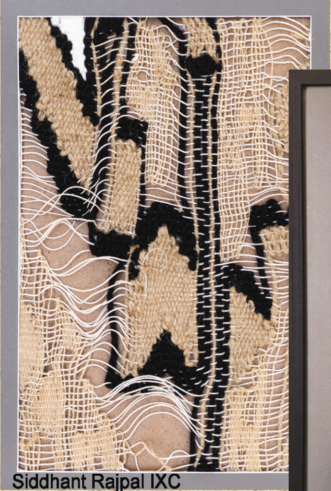
Siddhant Rajpal IXC