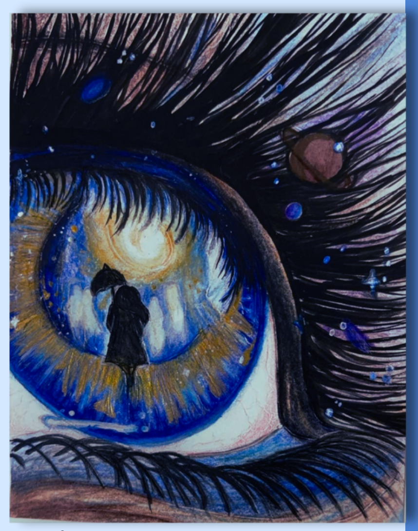
- Pritika Narsaria 11 B

"In any given moment, we have two options: to step forward into growth or step back into safety."